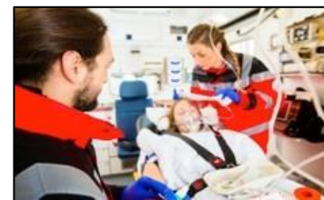
Table Top Exercise